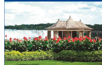
Visit beautiful Queen Victoria Park

Departure: Clifton Park Ice Arena, 16 Clifton Common Blvd, Clifton Park, NY @ 8 am